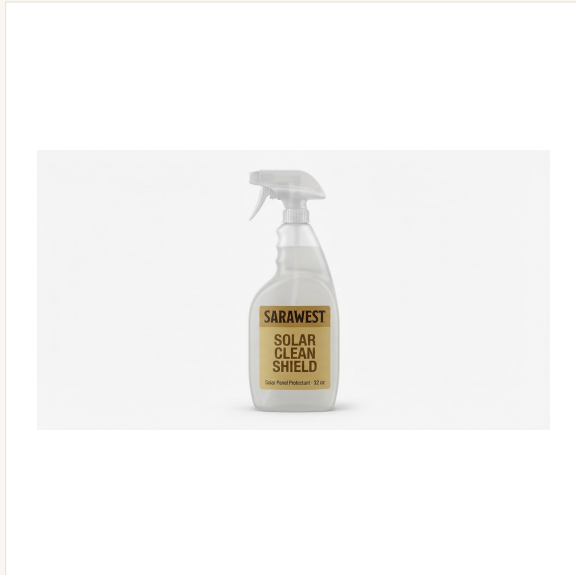
Concept image. Product can be customized to your specifications.

"Clean and protect in one system. Fewer truck rolls. Higher output. Better margins."