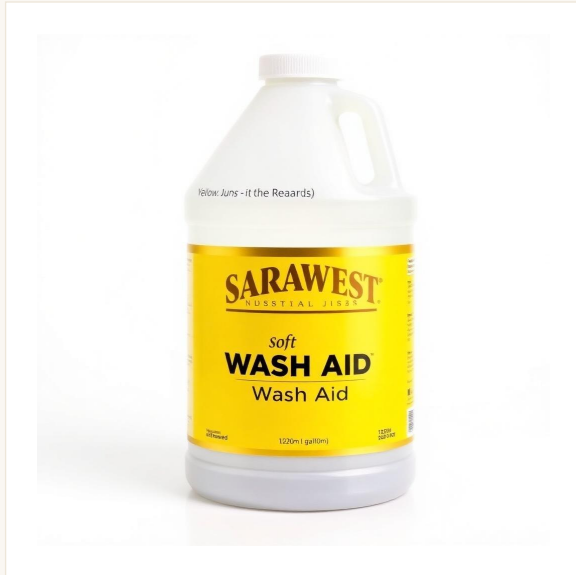
Concept image. Product can be customized to your specifications.

"A machine dishwashing liquid that effectively removes stains from ceramics, porcelain, china and crockery."