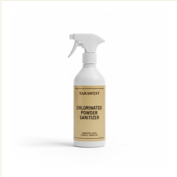
Concept image. Product can be customized to your specifications.

"A free flowing blue powder for the cleaning, sanitizing and deodorising of food preparation surfaces and internal compon"