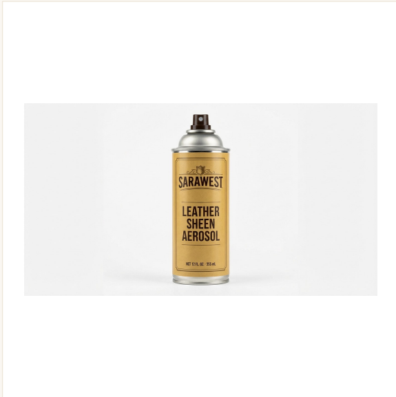
Concept image. Product can be customized to your specifications.

"Point, spray, shine — the fastest way to make leather look its best."