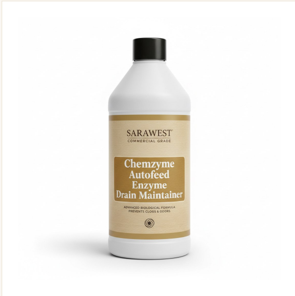
Concept image. Product can be customized to your specifications.

"Contains a specially selected blend of concentrated non-toxic natural microbes that effectively digest oils, fats, greas"