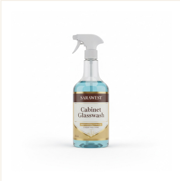
Concept image. Product can be customized to your specifications.

"For use in enclosed cabinet auto-glasswashing machines."