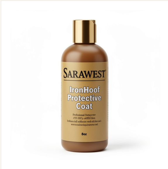
Concept image. Product can be customized to your specifications.

"Cracked hooves cost you money, time, and soundness. Stop the damage before it starts."