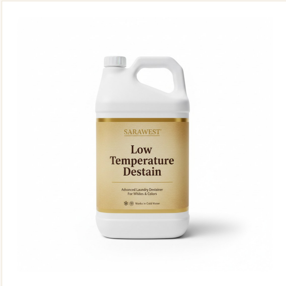
Concept image. Product can be customized to your specifications.

"An effective oxygen-based low temperature liquid destainer, which removes stains even at temperatures as low as 20°C, sa"