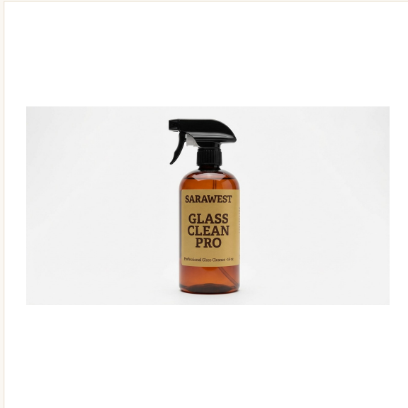
Concept image. Product can be customized to your specifications.

"Professional-grade cleaning at a fraction of the cost per panel."