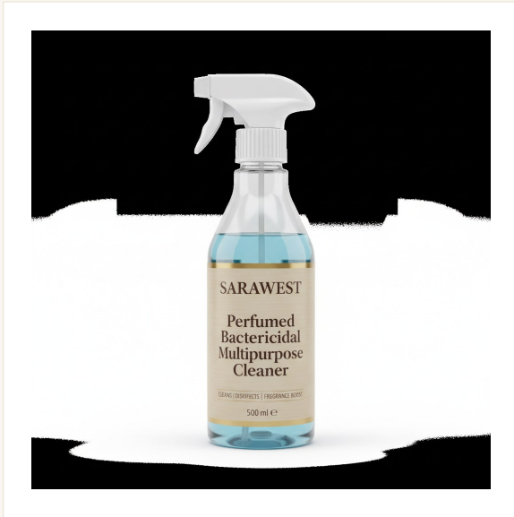
Concept image. Product can be customized to your specifications.

"A high quality performance, front of house product providing a high standard of cleaning, degreasing and disinfection."