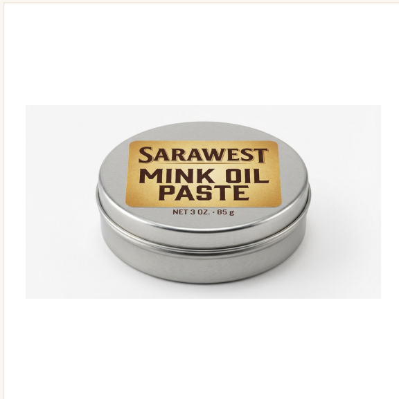
Concept image. Product can be customized to your specifications.

"Heavy conditioning and waterproofing for boots that earn their keep."