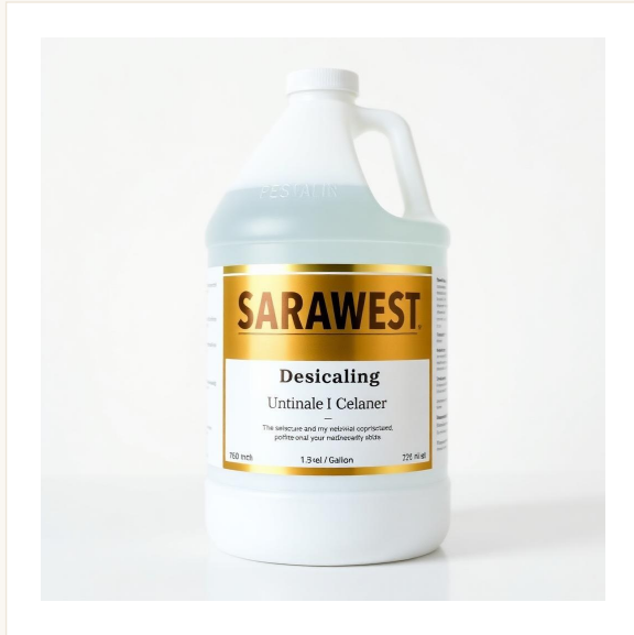
Concept image. Product can be customized to your specifications.

"A highly effective blend of naturally occurring microbes which degrade the organic matter upon which smell-producing bac"