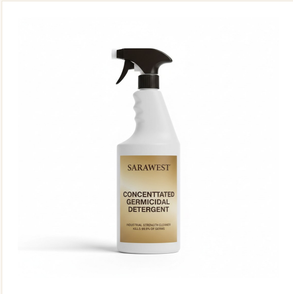
Concept image. Product can be customized to your specifications.

"A manual high active 20% pot washing detergent containing an effective bactericide to kill micro-organisms and prevent c"