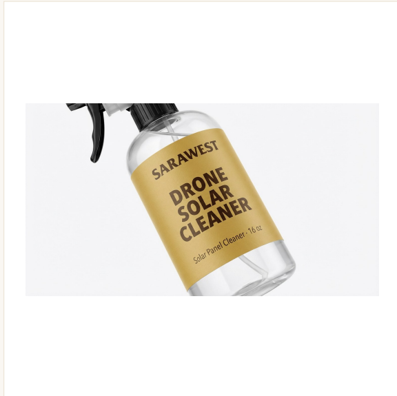
Concept image. Product can be customized to your specifications.

"Dirty panels lose money. Every day. This gets them back to full production."