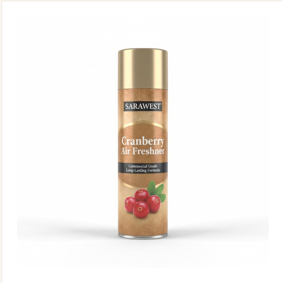
Concept image. Product can be customized to your specifications.

"High quality cranberry perfume ensures that it is effective, long lasting and economical."