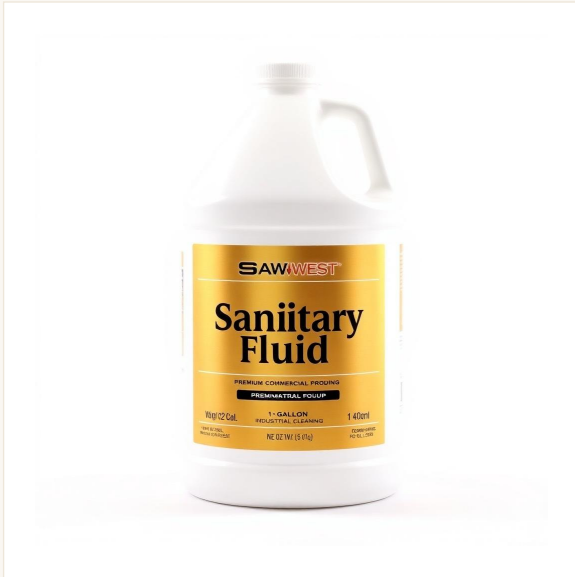
Concept image. Product can be customized to your specifications.

"A concentrated blue liquid with a refreshing pine fragrance."