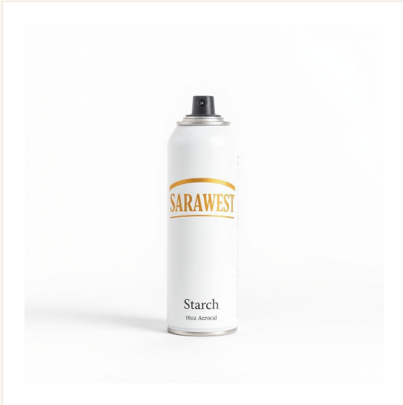
Concept image. Product can be customized to your specifications.

"Liquid PVA based starch can be added to the final rinse instead of conditioner to stiffen the cotton."