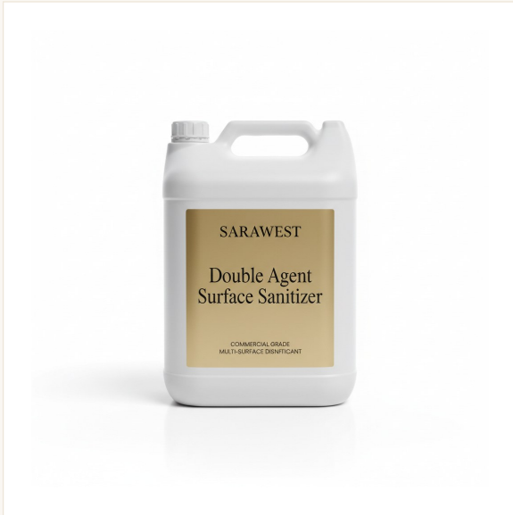
Concept image. Product can be customized to your specifications.

"Double Agent products are supplied in two colour coded formulations."