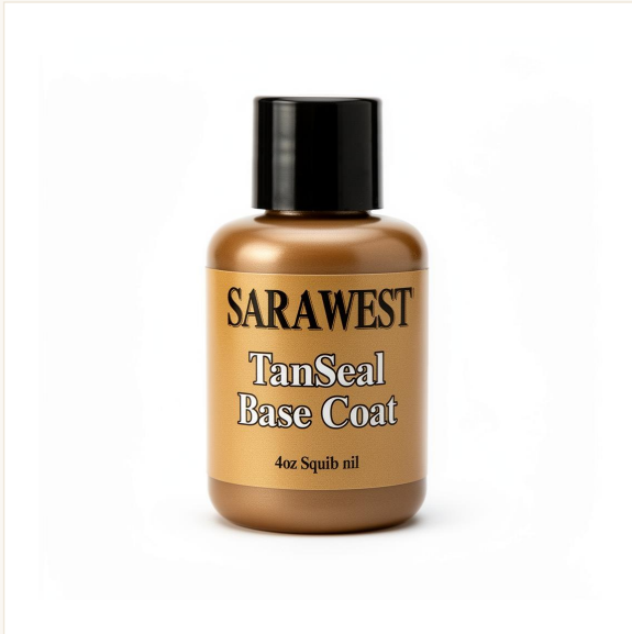
Concept image. Product can be customized to your specifications.

"The all-purpose finish that works on natural and dyed leather alike."