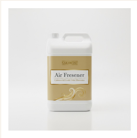
Concept image. Product can be customized to your specifications.

"Formulated to neutralise and deodorise natural body odours and stale tobacco."